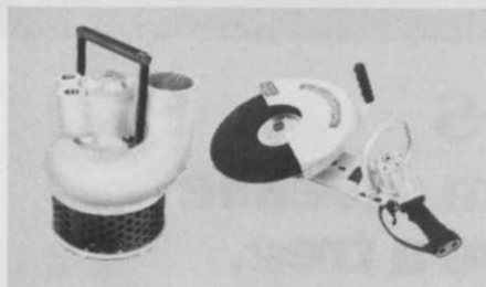
PUMP AND SAW