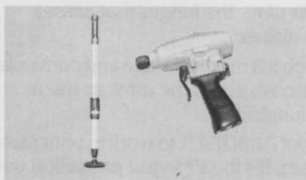
DRILL AND TAMP