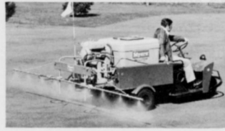
TL10 and 40 Series