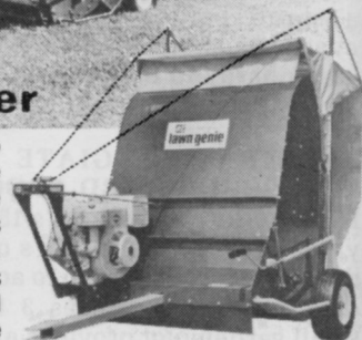
36", 60", 72" cutting widths - with or without loading hopper.

Mow smoothly and pick up clippings in one pass! The rugged, versatile Lawn Genie thatches lawns, verti-cuts greens, tees and fairways, sweeps leaves, wades through high weeds and empties easily from the tractor. It's the pick-up mower that cleans, mows and sweeps.