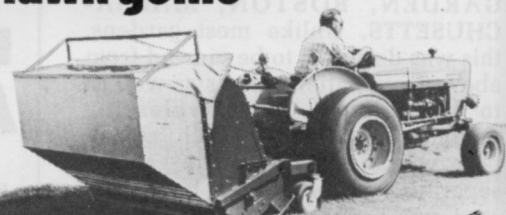
72" PTO Model