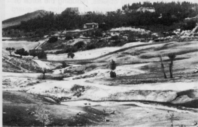
Making a habitat for exotic animals out of vast areas of cut and empty hills has taken six years.

In addition to providing beauty, the forest serves as a screen, windbreak and food source for the animals. The eucalyptus is cut and transferred