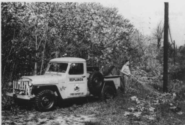
In the early days of electric line maintenance, Asplundh had one-man crews with little equipment