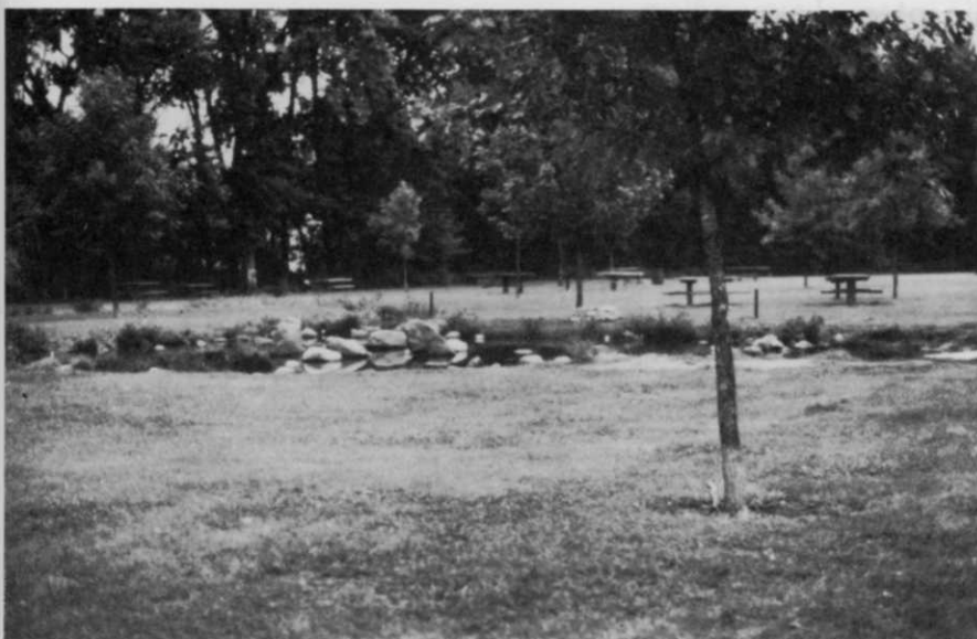
Department found an artesian well that supplies steady water.

Another park that Olsen says is maintained strictly for picnics has playground equipment spread throughout the area to distribute the wear. There are also some ponds