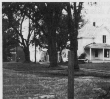
The Parks Department has purchased this farm and will return it to its "turn-of-the-century" state.