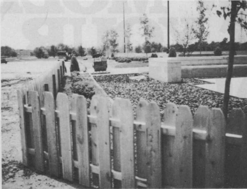
Extensive landscaping was done around a sandbox for small children.

ded with Merion Kentucky bluegrass. The infield is reseeded every year. The outfield is seeded on an as needed basis. Leusner reseeds the combination football/soccer fields every year, also.