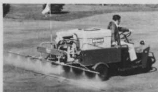
TL10 and 40 Series