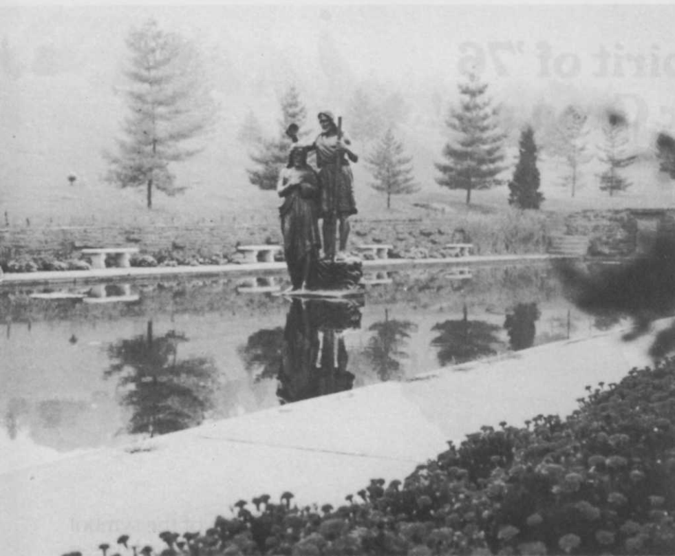
The lake, bordered with ornamentals, provides a serene natural setting.

chances are you'll tear something up," Neal adds.