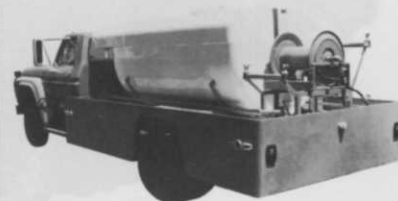
Model #PC 1200 fiberglass tank equipped with fiberglass pump cover, Model #D 200 gallon mixing tank shown mounted on a custom truck body by Strong Enterprises.

WHEN THERE'S NO SUBSTITUTE FOR THE BEST!