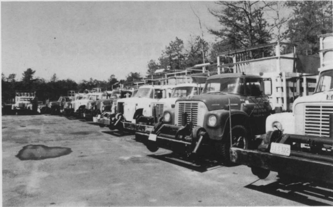
Hi-rail trucks, ready to roll.

quired to eliminate or control that problem. We base it on how long the job is going to take, what it is going to cost, and where we have to go to do the job.