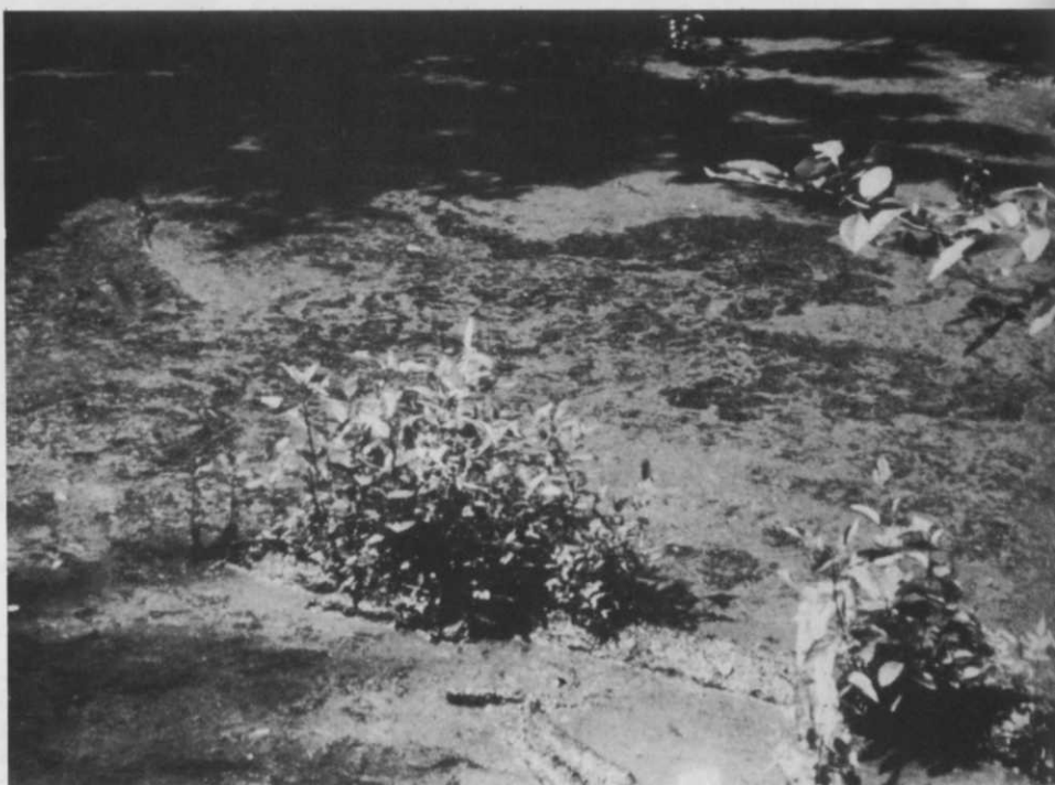
Forsighted management could have prevented this problem.

No, we are on a predetermined fee and we do what we have to do. Our cost fluctuates, heavier in the summer and lighter in the winter. That is the nature of the beast. We do not charge on a what we do basis because then it gets into a vast area of uncertainty, what did you do, and should it have been done, could we