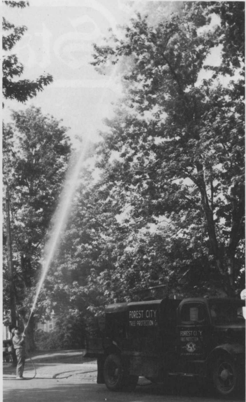
A high pressure hydraulic spray rig can cover the taller trees.

An estimate of the total cost of our chemical use is hard to say. In checking our inventory before I left I found about $20,000 worth of chemicals. Some of those will be sold though. We are using more expensive chemicals now. It used to be you could figure the chemical end of it was a relatively small cost and it was mostly labor and equipment. Now Methoxychlor costs around $6, give or take a dollar, a gallon. For example, if you use a one-to-one ration