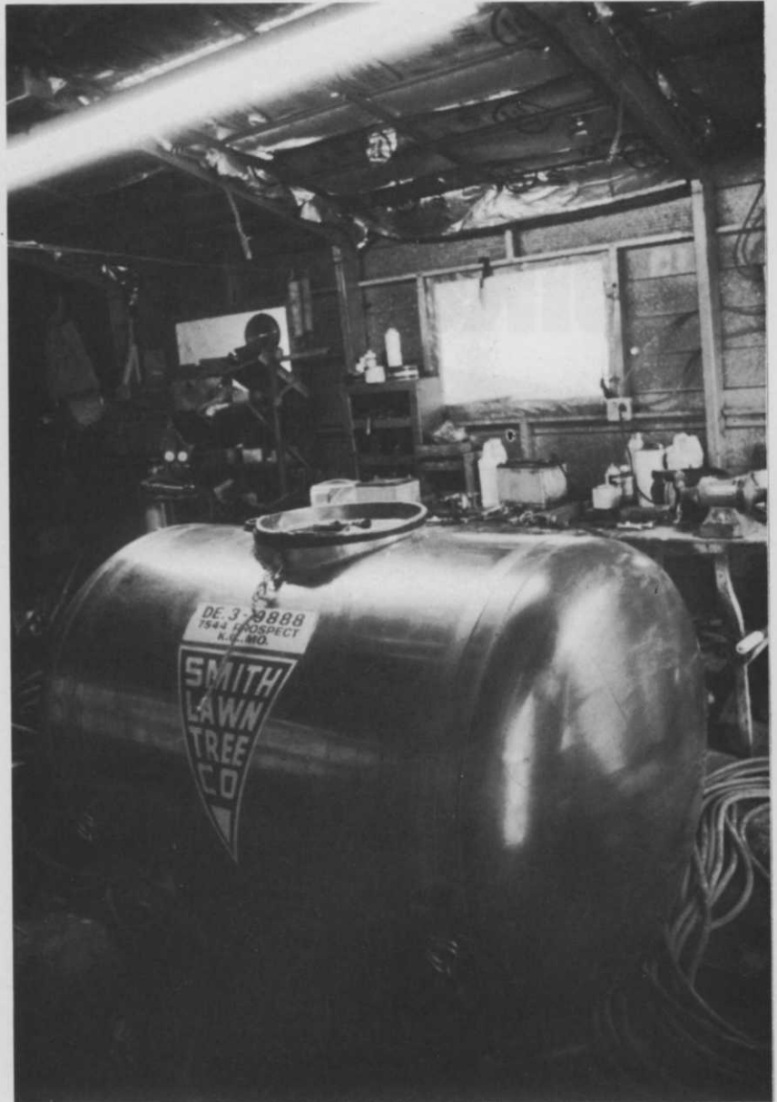
This 300-gallon spray tank, custom made for the firm by a Kansas City manufacturer, is rigged with motor and pump for 400 pounds of pressure.