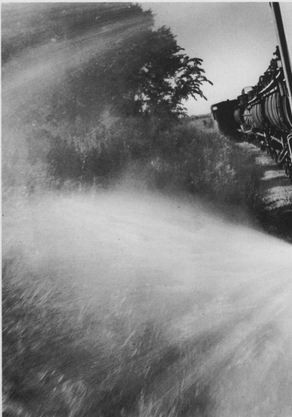
A long stretch of railroad rights-of-way can be sprayed utilizing a railroad spray car and a train of tankers.

Spraying a railroad is a three-fold operation. A yard program is