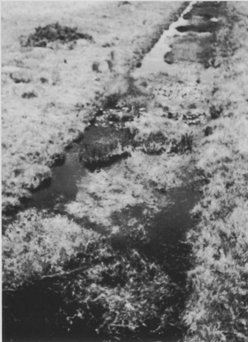
Aquatic weeds grow rapidly in a nutrient medium provided by surface run-off.