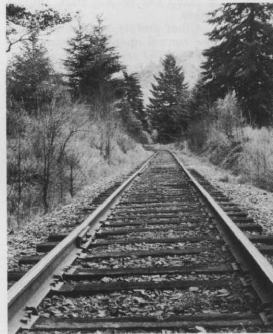
DOT insists that railroads have good visibility and safe operating conditions.

There's a lot of competition in this area. There's probably seven major people in this business in the country. There's a number of smaller applicators.