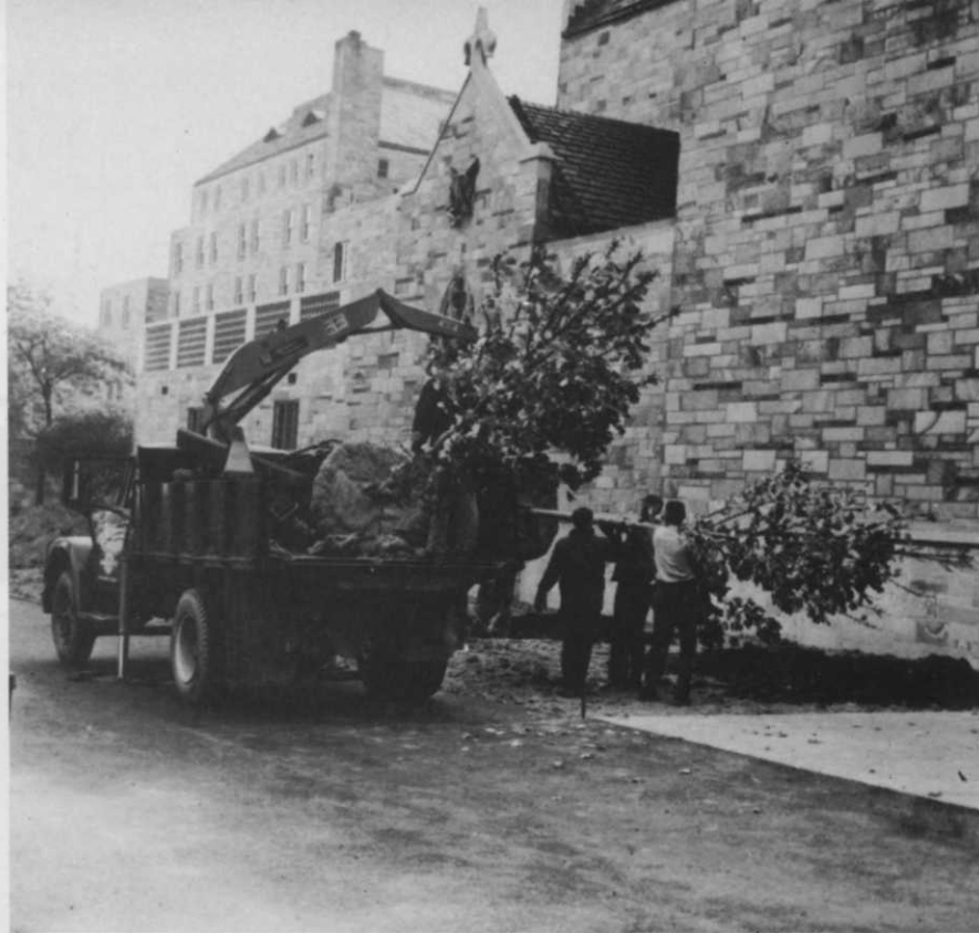
Tree protection begins with proper planting of a healthy specimen.

I never ask for a deposit. We take the customer on faith. I don't check their credit, though if I had my doubts I might. Most of the custom-