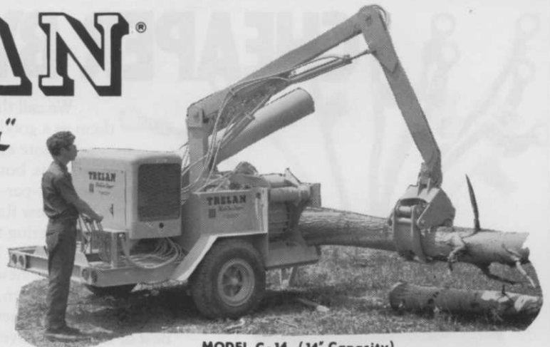
MODEL C-14 (14" Capacity)