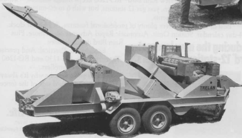
MODEL D-60 (18" Capacity)