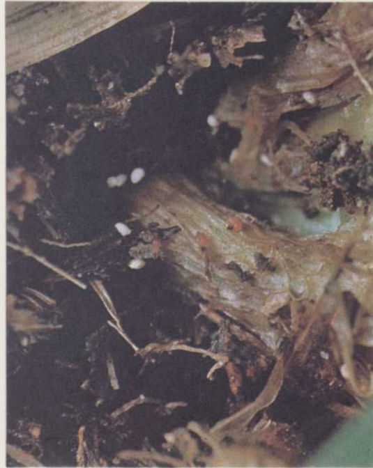
Bright reddish orange eggs are deposited in thatch from March to May. Eggs turn white and appear shriveled soon after being laid.