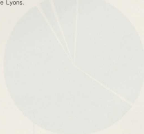
Bentgrass fairways of a Pennsylvania golf course in March showing areas damaged by the mite.