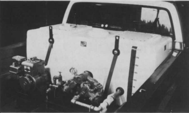
The PC200 Complete Pressure Spray Unit shown above with Myers 10 gallon/minute pump with pressures up to 500 PSI. (Also available FMC John Bean and Hypro pumps.)

We are not only the best! We are the only!