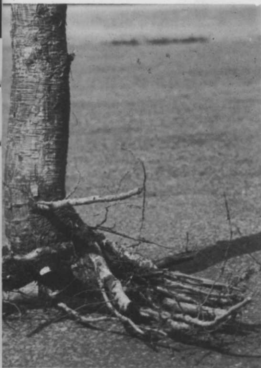
Root decline associated with wet, poorly drained soil.

Frost cracks on trees are caused by the expansion and shrinkage of bark and wood, which cause internal mechanical stress and result in the cracking or splitting of the wood and slipping of bark at the cambium layer. Tree species commonly affected by frost cracks are London