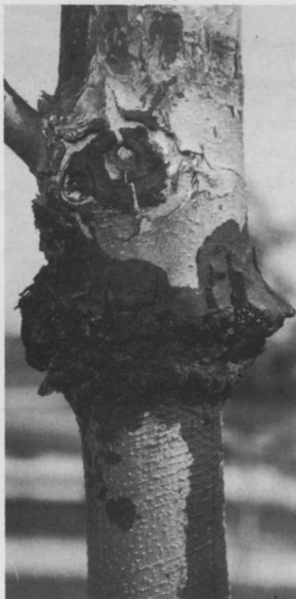
Mechanical girdling by a wire.