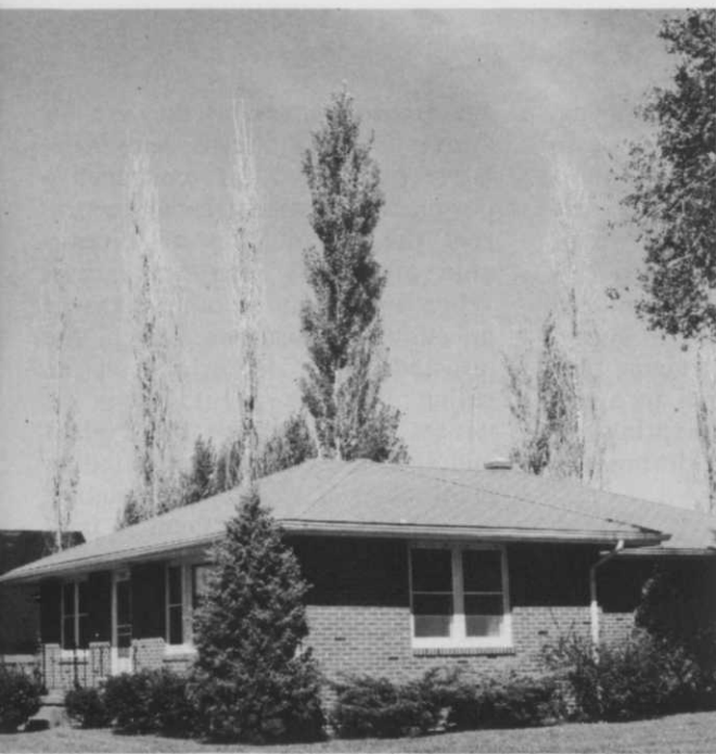
Numerous trees in a screen planting dying from Cytospora canker. Useful life expectancy is sometimes less than 10 years.