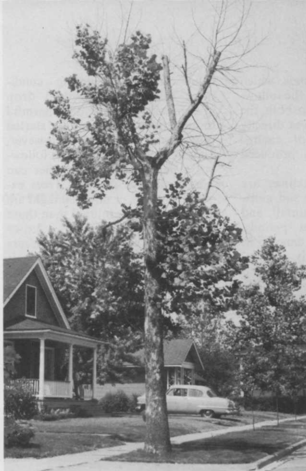
Sycamore decline believed caused by water stress and a canker disease.

Soils in urban areas, particularly along streets and around homes are often excellent examples of poor soil conservation and