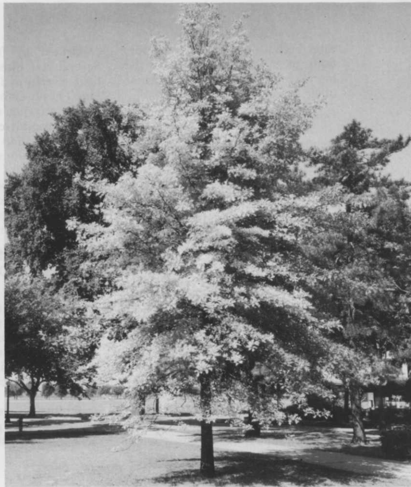
Pin oak chlorosis is a serious problem in soils with high pH.

does move slowly through the soil, frequent applications of calcium carbonate over the years will change the soil pH.