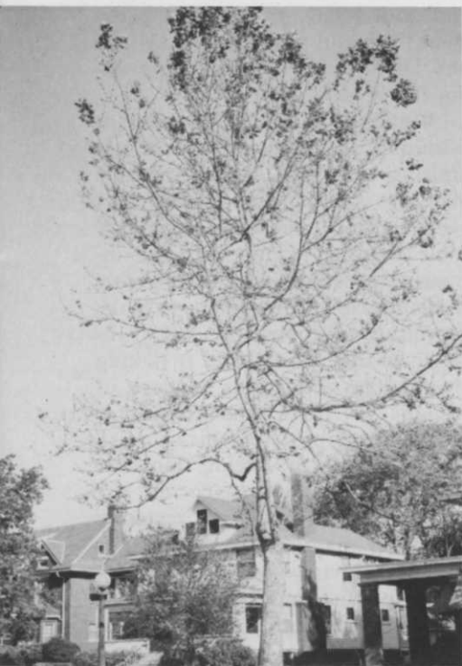
Sycamore anthracnose leaf diseases such as this tend to devalue the home from the presence of a denuded tree.