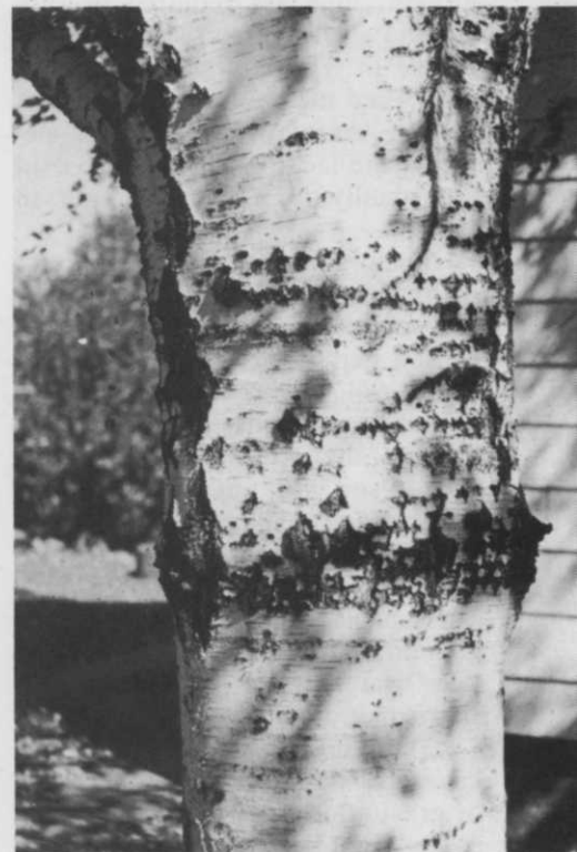
Sapsucker injury on white birch.