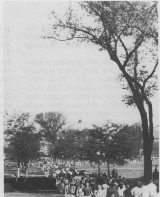
Before Dutch elm disease, shade and trees covered the landscape. After Dutch elm disease, or any devastating tree disease, we must start over.