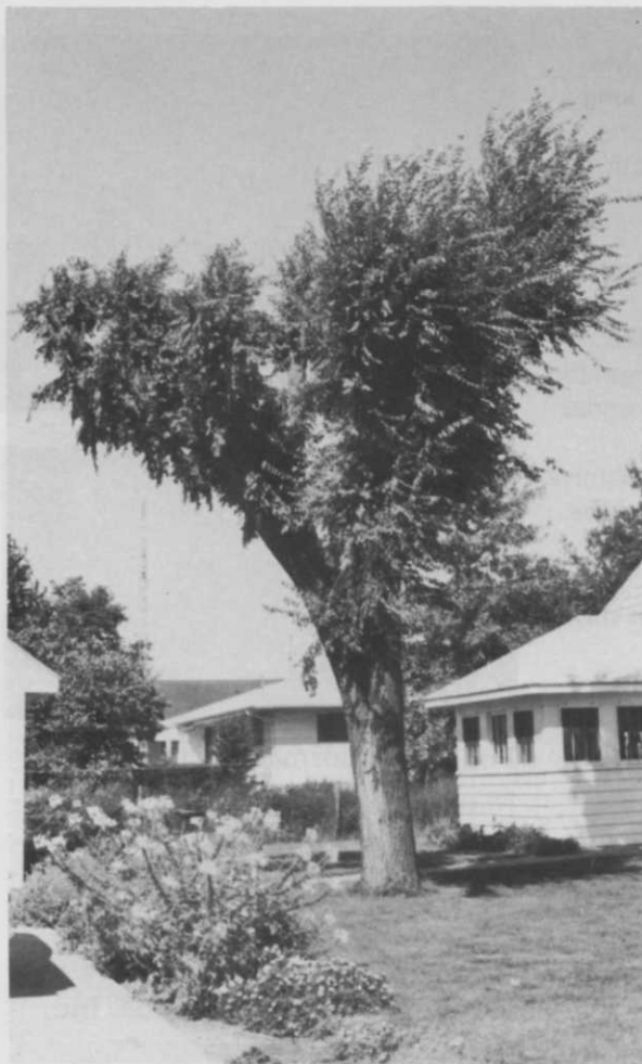
Feathery water sprout growth resulting from topping or dehorning as commonly practiced in some areas of the country.

Of all the stresses related to climate, prolonged dry periods and soil-water deficiencies have the greatest effect on the amount of growth a tree produces each year. The cambium growth either slows down or completely stops, depending upon the amount of available soil moisture. Drought will not only affect growth during the current growing season but can affect growth in later years. A summer drought affects the number of leaf