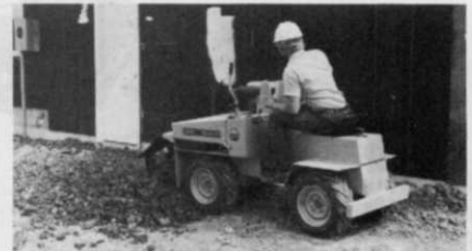
Circle 706 on free information card.

A four-wheel drive trencher designed to fill the gap between small two-wheel trenchers and the larger sophisticated rubber-tired trenchers, the Fleetline 14-4, has been introduced by Davis Manufacturing, Division of J I Case. The 14 horsepower trencher is equipped with a Kohler air-cooled electric start engine. It trenches from four inches wide, 45 inches deep to 12 inches wide, 26 inches deep at infinitely variable digging speeds to match varying soil conditions. It has a transport speed of 2.1 miles per hour.