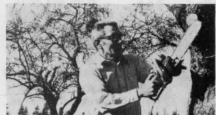
Circle 707 on free information card.

A chain saw powered by a 12-volt battery in a vehicle or carried by the user is being manufactured and marketed by Tensen Co., Inc. Known as the Minibrute, the 10 1/4 pound saw is equipped with a 10-inch Oregon chain and bar. Its 1.2 horsepower motor turns the chains 2,500 feet per minute. Its overall dimensions are 22 inches x 12 inches x six inches. The chain is oiled automatically every time the saw is turned on; it also has a manual pump for pre-cutting lubrication. The oil chamber holds six ounces and has a clear, plastic sighting tube.