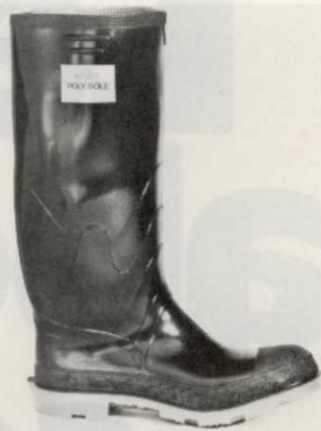
Circle 711 on free information card.

Protective footwear, injection-molded of PVC and polyurethane for traction, abrasion-resistance and protection against acids, chemicals and oils, has been introduced by Goodall Rubber Co. The "Poly-Sole" boot is available in sizes 6 to 13 with a steel safety toe that meets ANSI specifications. The molding process eliminates seams as a source of leaks. The upper is light, has low-temperature flexibility for maximum mobility and comfort and resists chemicals. A pants-gripper at the top of the boot holds trousers snugly inside.