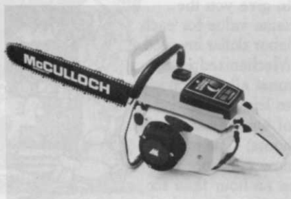
Circle 703 on free information card.

A chain saw designed to appeal to all professional woodcutters and industrial users, the Super Pro 70, has been introduced by McCulloch Corp. The unit offers a chain brake which reduces hazard from kick-back. It is powered by a 4.3 cubic engine, weighs 15 3/4 pounds (power unit only) and the operator is insulated from vibration by McCulloch's patented system.