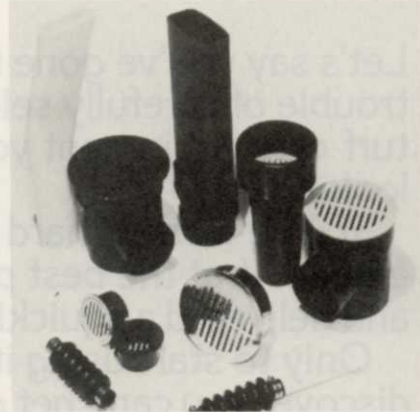
Circle 712 on free information card.

National Drain Supplies, Inc., has broadened its 1976 line of pipe, fittings and drainage/sprinkler system specialties to include six new items.