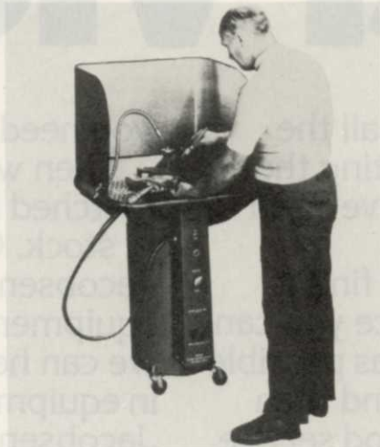
Circle 709 on free information card.

A parts washer from Weil Service Products Corp. is a completely self-contained parts cleaners and degreaser. Parts to be cleaned are placed on a recessed screen on top of the unit, where they are pressure-washed by a variable blast of clean solvent. The dirty solvent then drains into the pedestal of the unit, where it is micron-filtered to a user-selected fineness of five to 100 microns until it is clean. Expensive solvent is continuously recycled, renewed and conserved to be used again. The unit operates effectively with from six to 15 gallons of solvent.