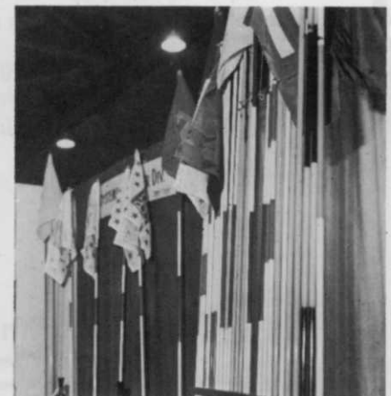
LEWISystems/Container Development exhibit.