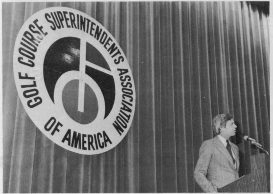
Noted author George Plimpton, keynote speaker at opening ceremonies in Minneapolis.