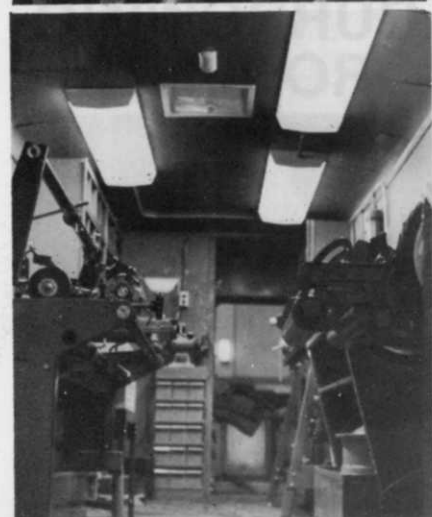
The inside of Toro's maintenance work wagon.