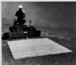
With optional 6½' x 6' drag mat

It reduces infield maintenance time dramatically, and turns out a well-conditioned "pool table" playing surface for the players. The hydraulically raised and lowered box scraper and scarifier does it. Hydrostatic drive to all 3 wheels for power, traction, low maintenance. It's backed by Toro people, by Toro parts and service, and by our new one year warranty.