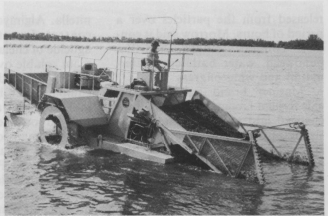
The H-650 Harvester for aquatic weeds from Aquamarine Corp.