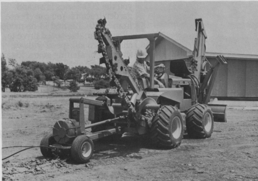
This Ditch Witch Modularmatic is equipped with the Combo module for both trenching and vibratory plowing; a backhoe module is mounted on the front

Call (800) 654-6481 Toll Free for the name of the dealer nearest you.