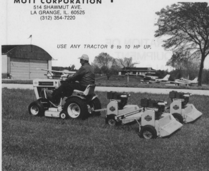
USE ANY TRACTOR 8 to 10 HP UP.