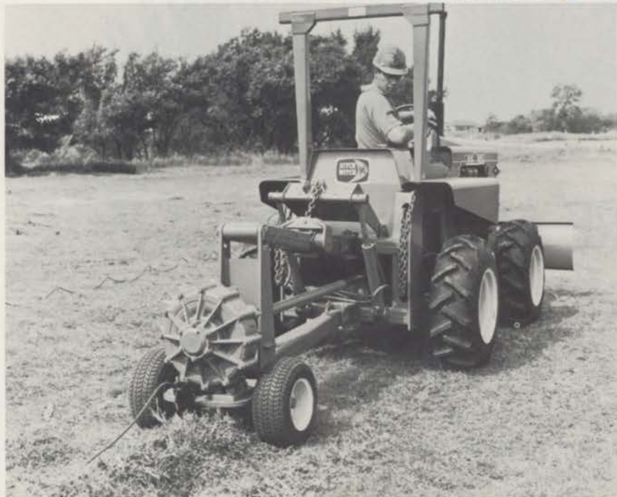
Vibratory plow modules are available for Modularmatic vehicles in the 30-HP to 65-HP range.

Call (800) 654-6481 Toll Free for the name of the dealer nearest you.