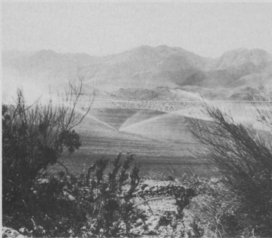
View of Rain Bird No. 51 SAM rotor on first landing zone from the tee in the most unique golf course in the desert. The roughs are undisturbed natural desert and the golfer must tee off over the natural roughs to the landing zone.