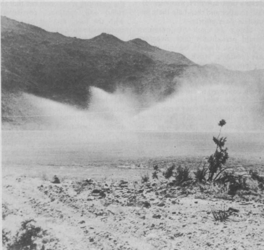
The No. 51 SAM rotors provide an artificial oasis on this desert golf course.

It was not a creeping grass so there would be no problem of its spreading into the natural desert areas at Ironwood. However, this same characteristic meant that the recovery rate of divots on the fairways would be slower. It would result in more hand seeding and top dressing on the fairways. A