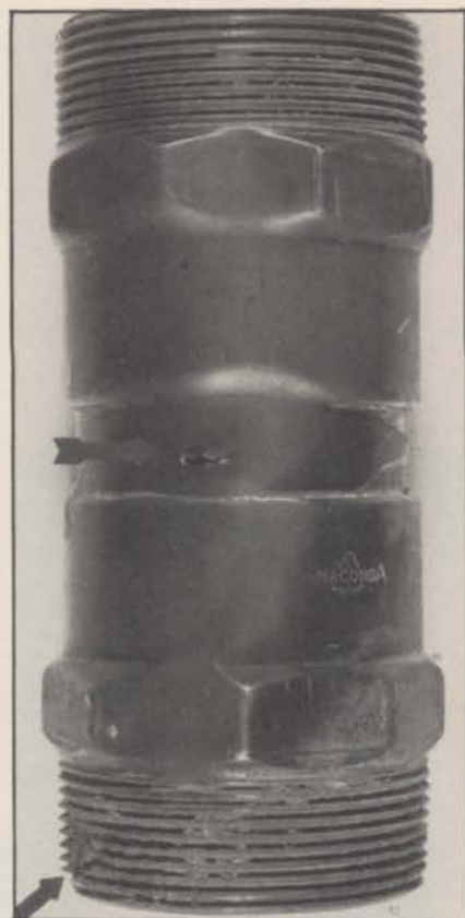
This is the medium piece — a two inch ips male thread-to-tubing nipples joined together to a short length of two inch copper tubing by soldered joints.

7) Stress—Metallurgical examinations showed no stress corrosion