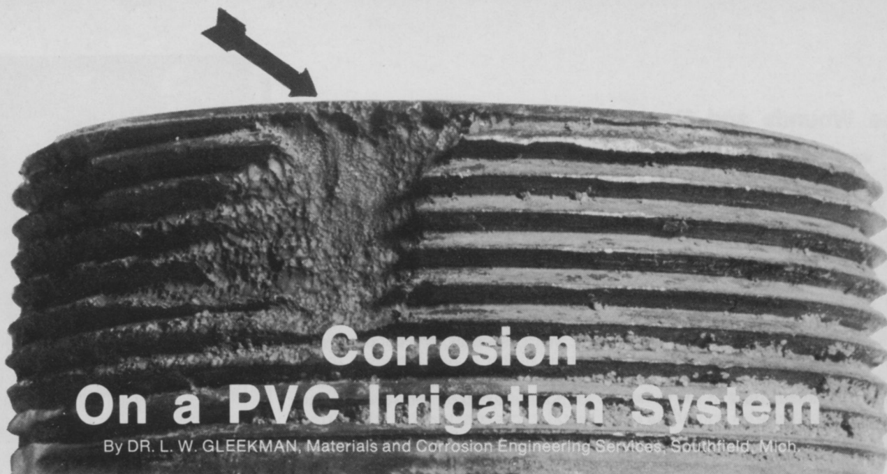
A two and one-half inch ips male thread-to-tubing nipple.

ONE WOULD ordinarily think that copper fittings on an underground plastic piping system would not corrode; there is much experience to back this up. This was not the situation, however, in an automatic sprinkler system installed several years ago in the community center of a major city in Michigan where an abnormal situation resulted in leaking at the copper fittings.