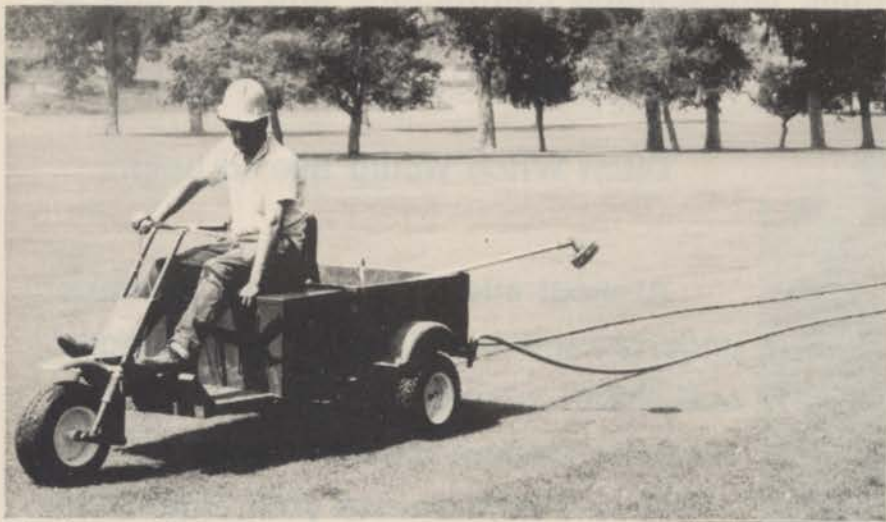
There's a trend back to low-cost three-wheelers for some types of work. Here a groundsman at Oakmont Country Club in Glendale, California pulls a long hose from one job site to another.