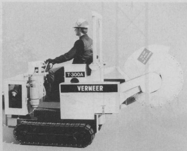
T-300A ROOT CUTTER: Vermeer Manufacturing Co., Pella, Iowa

This algaecide is registered for use in swimming pools, lakes and fish hatcheries, rivers, irrigation ditches, and potable and waste water reservoirs. Treated areas may be used immediately for fishing, swimming, watering or irrigation. The algaecide comes concentrated, in quarts or gallons, and is applied by using hand or power sprayer. Initial treatment should be made when algae first becomes visible and water temperature is above 60 degrees F. Subsequent doses will prevent regrowth, according to the manufacturer. For more details, circle (705) on the reply card.