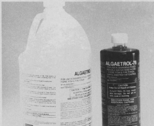
ALGAETROL-76: Thompson-Hayward Chemical Co., Kansas City, Kan.

This algaecide is registered for use in swimming pools, lakes and fish hatcheries, rivers, irrigation ditches, and potable and waste water reservoirs. Treated areas may be used immediately for fishing, swimming, watering or irrigation. The algaecide comes concentrated, in quarts or gallons, and is applied by using hand or power sprayer. Initial treatment should be made when algae first becomes visible and water temperature is above 60 degrees F. Subsequent doses will prevent regrowth, according to the manufacturer. For more details, circle (705) on the reply card.