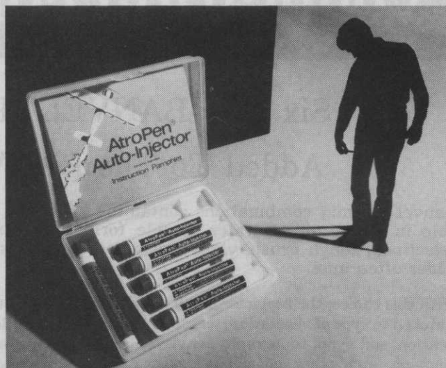
ATROPEN AUTO-INJECTOR: Survival Technology, Inc., Bethesda, Md.

This new vise holds chain saw firmly and securely; frees both hands, allows you to sharpen chain, clean air filter, adjust carburetor or perform other service requirements. Vise screws into a tree stump; the jaws clamp the guidebar and hold the saw in such a position that the chain can be moved freely around the bar. Made of welded steel, the Clamp-tite weighs 2¾ pounds. The vise can also be used to fasten an axe for two-handed sharpening. For more details, circle (707) on the reply card.