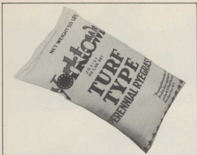
YORKTOWN: Lofts Pedigreed Seed, Inc., Bound Brook, N.J.

Yorktown, Loft's new turf type perennial ryegrass, will soon be available to professional turf managers. The new variety is said to be an extremely rugged perennial ryegrass that can take unusual stress. One outstanding feature, according to manufacturer, is its excellent mowing characteristics. When independently tested against 15 other varieties of perennial ryegrass, Yorktown is said to have scored highest for overall quality and coloring. Seed for testing purpose is currently available. For more details, circle (701) on the reply card.