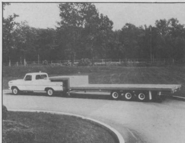
MODEL MF FLAT-BED TRAILER: Clark Equipment Company, Michigan City, Ind.

Available in AC Series, models 3MPUB-115 (solid brass) and 3MPUP-115 (high density polyethylene) move up to 360 gallons per hour, yet weigh only 5½ lbs. Both are available in battery-powered 12-volt versions. DC units are ideal for field application where AC power is unavailable. Impellers are made of Nitrile, compounded for long flow life, and resistant to oil, water and abrasion. Full circle cam eliminates body wear. AC unit has continuous duty series type motor with stainless steel shaft. DC unit has enclosed permanent magnet motor. For more details, circle (705) on the reply card.