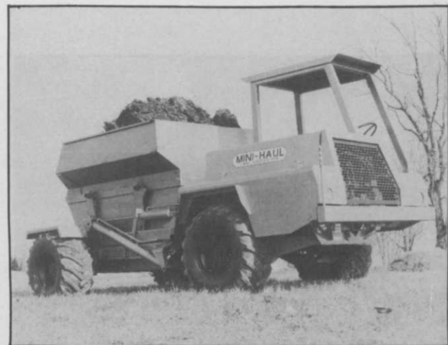
MINI-HAUL: Schnelder's Welding & Manufacturing, Inc., Menomonee Falls, Wisc.

An optional propane fuel system for Bucky rough terrain forklift truck is now available from Badger Dynamics, Inc. Bucky is designed for applications in material handling for construction, industry, agriculture and commercial markets. Manufacturer says new 33 lb. propane tank provides Bucky with three to five hours of operation before refueling. Capacity for propane machine remains the same as the gasoline-powered counterpart — 2500 lbs., with roller type mast reaching to 14 feet as standard. Low profile mast is optional. For more details, circle (707) on the reply card.