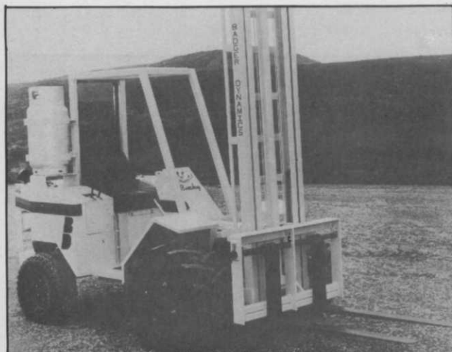
PROPANE FUEL SYSTEM: Badger Dynamics, Inc., Port Washington, Wisc.

Clark has introduced a flat-bed mini-trailer for pickup trucks that can decrease equipment investment and increase operating flexibility for light, bulky hauling by freeing costly truck tractors for heavy loads, according to manufacturer. Inverted fifth wheel mounted under the "gooseneck" couples to a 2-inch SAE kingpin that folds into the pickup floor when not in use. Model MF is available in 22- and 30-foot lengths and features optional side rails for the drop deck area. For more details, circle (706) on the reply card.