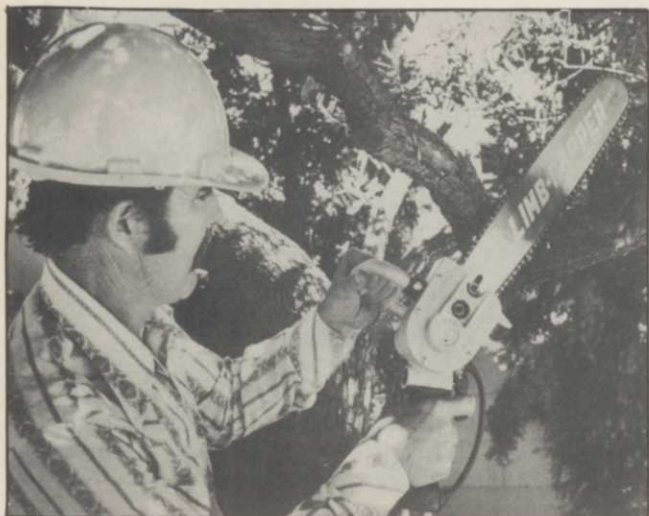
HYDRAULIC PISTOL GRIP SAW: Limb Lopper, Santa Fe Springs, Calif.

Hesston's new StumpRazor features six individual cutting teeth on a rotating head which shave stumps down to 6 inches below the ground. Safety shields protect operator from debris. This one-man method for removing any size tree stump less than 5 inches above the ground eliminates chopping, sawing and digging. Powered by an 8 hp Briggs & Stratton engine, StumpRazor features welded box frame construction. Replaceable cutting teeth are made of a tungsten-carbide alloy. For more details, circle (702) on the reply card.