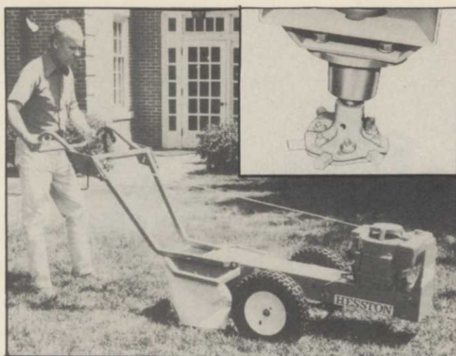
STUMPRAZOR: Hesston Corporation, Indianapolis, Ind.

Yorktown, Loft's new turf type perennial ryegrass, will soon be available to professional turf managers. The new variety is said to be an extremely rugged perennial ryegrass that can take unusual stress. One outstanding feature, according to manufacturer, is its excellent mowing characteristics. When independently tested against 15 other varieties of perennial ryegrass, Yorktown is said to have scored highest for overall quality and coloring. Seed for testing purpose is currently available. For more details, circle (701) on the reply card.