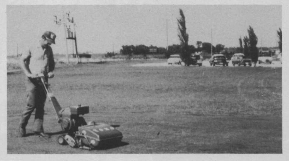
The greens on Meaker's Rogala Public Links were ready for play in about two months, following an extensive mowing and fertilization program.