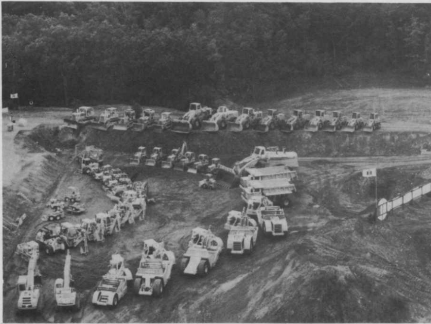
International Harvester's comprehensive line of construction and industrial equipment.