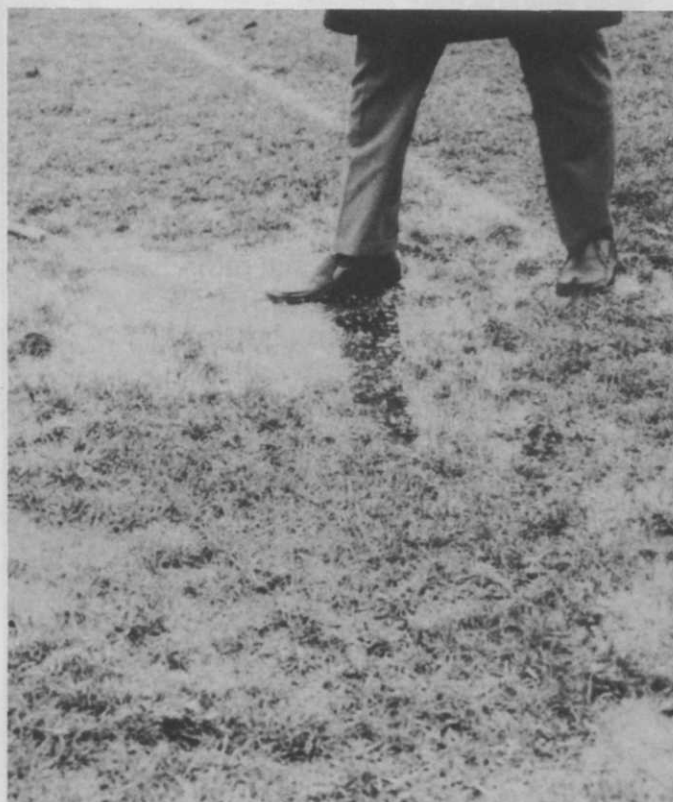
Excess water is placed on a PAT field by a one inch hose.