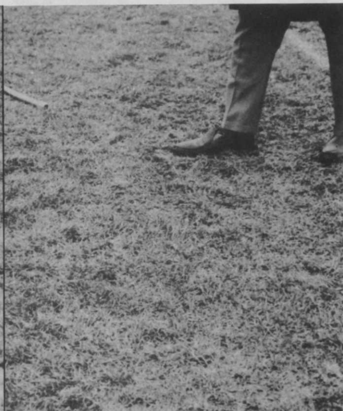
All water is pulled away by pumps and gravity within 10 minutes.