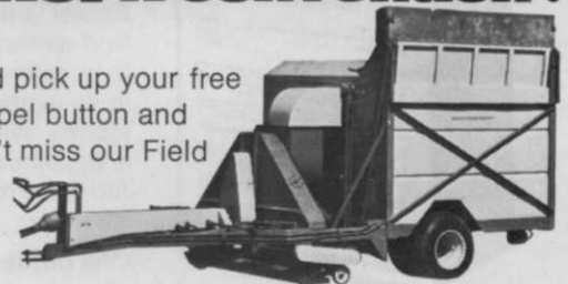
NUNES Vacuum Sweeper