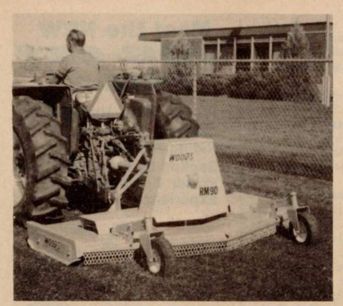
REAR-MOUNTED LAWN MOWER: Woods Division of Hesston Corp., Oregon, III.

The new model RM90 covers a 7 and one half foot cutting swath. The blades overlap for a smooth, clean cut that leaves turf with a freshly manicured appearance. The 3-point hitch hook-up is designed for fast, easy and safe attachment to tractors with 25 to 50 HP ratings. For more details, circle (709) on the reply card.