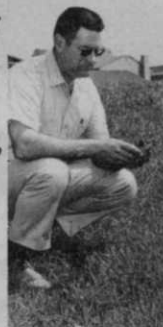
WITH TERRA TACK

Box 584, Plainfield, N. J. 07061 (201) 755-0921