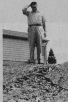
WITHOUT TERRA TACK