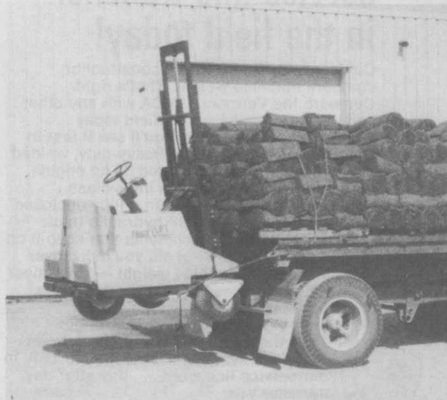
FRATE LIFT: Brouwer Turf Equipment Limited, Keswick, Ontario

New roller sprayer pump delivers up to 26 gallons per minute at pressures up to 200 PSI. It has a 15/16 inch diameter stainless steel shaft and is equipped with an adaptor for direct mounting on 540 RPM tractor PTO shafts. Pressure-tested pump housing is available in cast iron or Ni-Resist for corrosion and abrasion resistance. Leather or Viton shaft seals are available optionally in place of standard Buna-N seals. Standard rollers are teflon for most applications; nylon and rubber rollers can be substituted to fit the job. For more details, circle (702) on the reply card.