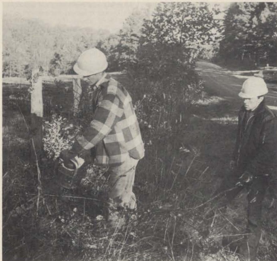
Mechanical cutting of brush along fence line is a slow two-man operation — one man cutting, the other handling cut brush.

On left: Basal stem treatment by Townsend Tree Service crewman involves application of "Hyvar" X-L to tree trunks four inches in diameter or less. Bottom 18 inches is sprayed.