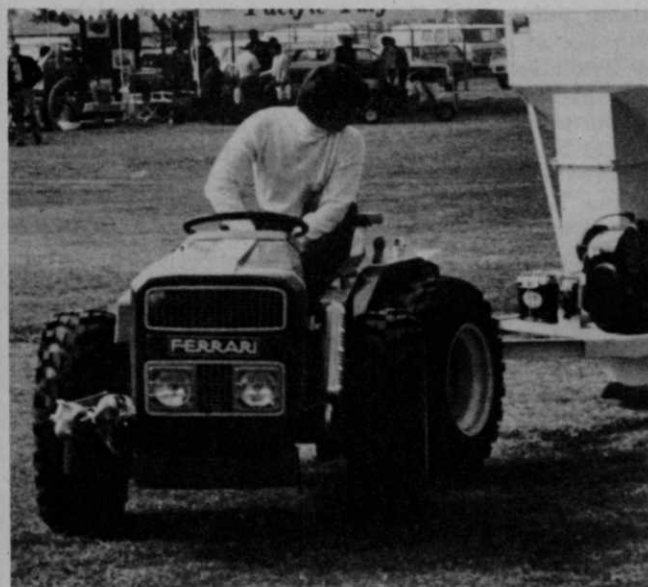
76 TURF SPECIAL: Ferrari Tractors, Inc., Carlsbad, Calif.

This self-propelled, water driven unit is ideal for use on any uneven odd-shaped area or any area obstructed with trees, utility lines or buildings. Adjustable travel speed and water rate application settings are easily set. The units feature an automatic throw-out clutch and long-life irrigation hose. The larger units sports a built-in hose reel powered by a 5 hp gasoline engine. For more details, circle (706) on the reply card.