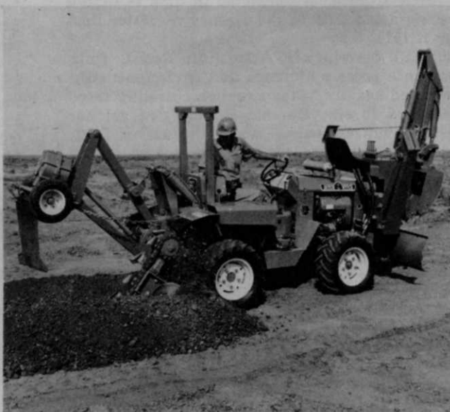
MODULAR-MATIC DITCH WITCH: Charles Machine Works, Inc., Perry, Okla.

This tractor has an air-cooled 45 hp diesel engine, weighs 2,850 pounds and displaces its weight and traction over all four wheels. Power articulated steering gives extremely tight turning radius and extra wide 12.00 x 16 terra-tires give hillside stability. It has a standard three-point hitch and a 2-speed P.T.O. that handles conventional domestic implement rpm operating ranges. For more details, circle (707) on the reply card.