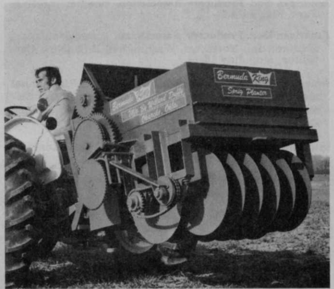
"LANDSCAPE SPECIAL" SPRIG PLANTER: Bermuda King Co., Okarche, Okla.

Front-wheel drive with extra large (10 x 2.75) tires makes this mower more maneuverable and easier to handle in rough terrain. Without engaging or disengaging a clutch, you can trim around shrubs, trees and the hard to get changes of cutting height. This model is equipped with a 4 hp engine, a five-quart fuel tank and a snorkel-type air cleaner mounted on the handle. For more details, circle (703) on the reply card.