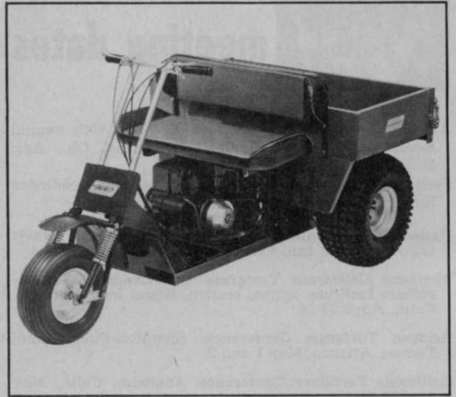
POWER-KART: SNOW CO. Omaha, Neb.

This new safety device is designed to stop a machine at the critical moment to prevent or minimize operator injury. It is activated by the operator's voice and is immune to engine sounds and other mechanical noises. The six-ounce, cigarette pack-sized transmitter is carried in a pocket or worn on the operator's clothing. When activated by a shout or scream, it transmits a radio signal to the machine-mounted receiver unit. The receiver unit instantly shuts off the machine's electrical power or fuel supply. For more details, circle (701) on the reply card.