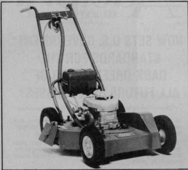
HEAVY DUTY 22 INCH SELF-PROPELLED MOWER: Bunton Co., Louisville, Ky.

This rugged, three-wheeled grounds maintenance vehicle features a unique variable speed, torque amplifier drive unit. The cart seats two people, hauls up to 350 pounds and is equipped with spring-loaded front fork suspension. Wide flotation-type rear tires buck through mud, snow and sand and at the same time prevent compaction when driven over turf. For more details, circle (702) on the reply card.