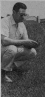
WITH TERRA TACK

Terra Tack as a spray helps control soil erosion.