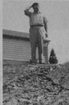
WITHOUT TERRA TACK