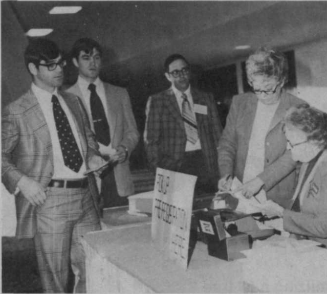
More than 300 attended this year's technical conference. Registration overflowed the headquarters hotel as well as four other local motels. Nineteen speakers discussed subjects from energy to drip irrigation.