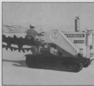
T-600B—Strongest trencher on tracks.