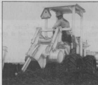
M-437—Rugged 37 hp machine.