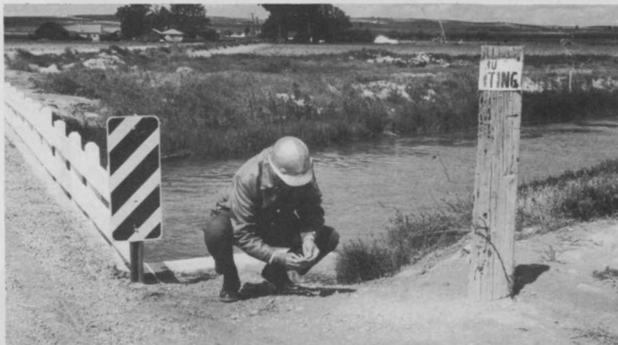
Weed treatment at bridge over irrigation canal is checked six months after treatment by Supervisor Davenport of Nampa district. He handles road maintenance programs in one of Canyon county's four road districts.