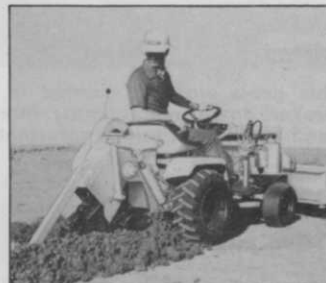
M-147H— "Easy Ridin'" 14 hp unit.

For More Details Circle (122) on Reply Card