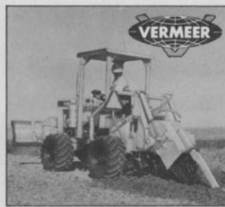
M-470 — Multi-purpose 62 hp unit.