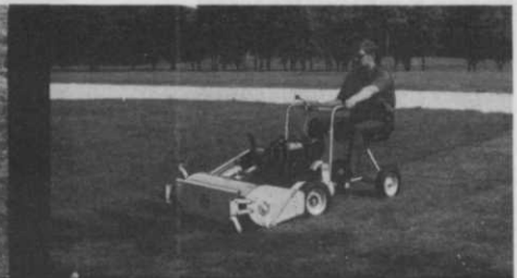
AND FINE LAWNs TOO!