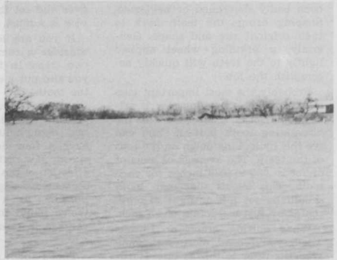
Following treatment, the same area now appears clear and inviting to area residents and sports fishermen. Applicators used 2,4-D B.E.E. to control the weed.