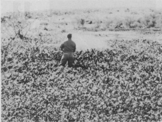
Shoreline areas such as this owned by the Miller Ranch were solid with Water Hyacinths. It was like a floating carpet to view. Fish populations were reduced.