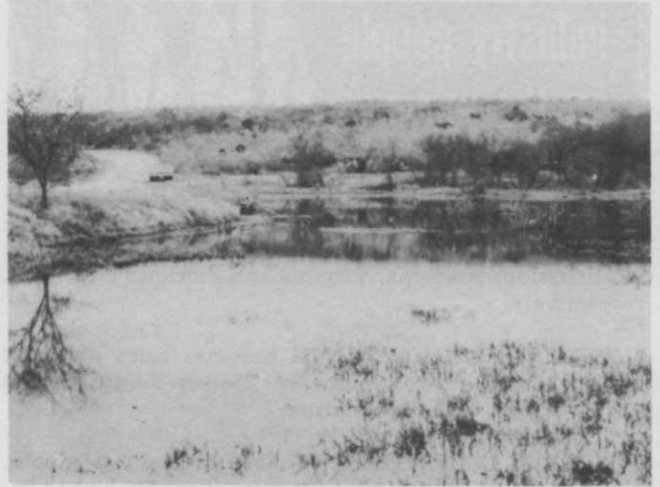
Even though it is somewhat marshy, the same area takes on a different view after treatment. Estimated benefits are on increase of $100 per acre after spraying