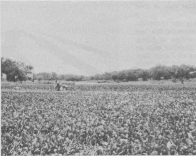
This is the way Buffalo Cove at Lake Corpus Christi looked prior to treatment. Water Hyacinths are so thick that small boats become entangled.