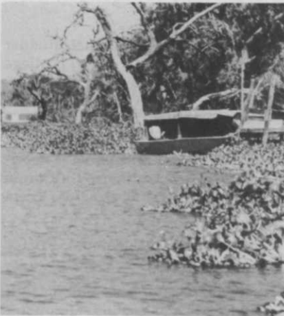
Jones camp below the horseshoe at Lake Corpus Christi takes on a forbidding look prior to treatment.

Professional people in weed control work are by necessity very cautious. Application methods are strict-