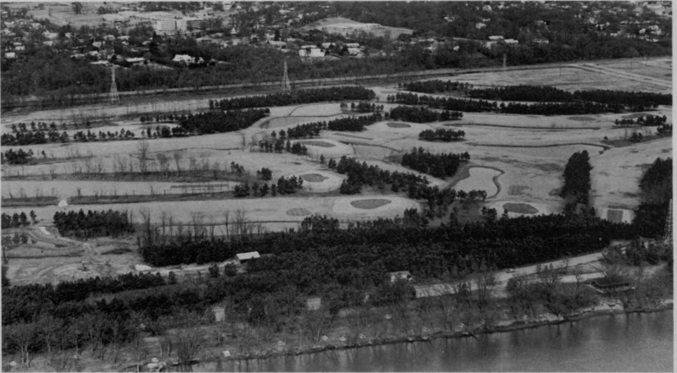
The McFarland Park Golf Course lies on a floodplain separating the business and residential section of Florence, Ala.