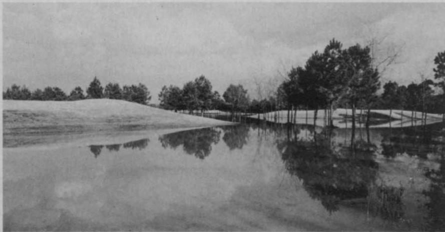
The 15th (l) and 17th greens stay high and dry as nearly five feet of flood water covers fairways and rough.

For More Details Circle (148) on Reply Card