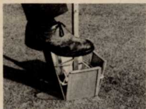
1 Damaged section of turf neatly cut by blades . . . one at a time.