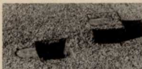
2 Wedge-shaped sod lifts out cleanly.