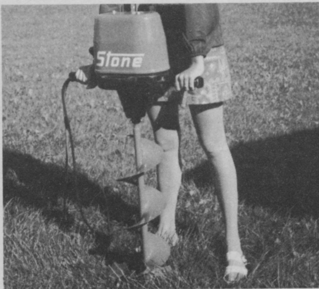
12 VOLT DIGGER: Stone Construction Equipment, Inc., Honeoye, N.Y.

Any vehicle up to 1400 pounds can be raised as high as 33½ inches and lowered to floor level without a need for expensive loading docks. Perform maintenance on lawn and garden tractors, snow blowers, golf carts and other vehicles with little or no effort. Unit is made of heavy gauge pipe. Rails adjust from 24 to 40 inches. Lift is powered by a C.T.&E. reversible one-half inch electric drill with adapter. For more details, circle (706) on the reply card.