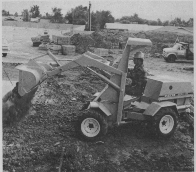
FOUR-WHEEL DRIVE FRONT-END LOADER: Davis Manufacturing, Div. of J I Case Co., Wichita, Kans.

These hydraulic chain saws come in bar sizes of 12, 15, 18 and 24 inches. They're powered by hydraulic pressure from tractors, trucks and other hydraulically equipped vehicles. Motor which turns saw chain provides the highest power-to-weight ratio of any hydraulic motor on the market, according to the manufacturer. Nothing else is on the saw but a trigger handle. Saw weights only six pounds without bar. But it gives the operator eight horsepower of direct drive. Features instant stop and start. For more details, circle (709) on the reply card.