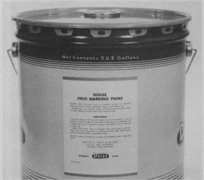
FIELD MARKING PAINT: C. B. Dolge Company, Westport, Conn.

Slope mowing becomes safer and more efficient with this new and unique tractor seat. It is self-leveling. Seat and the tractor operator remain in a level position while the tractor is on a slope, even up to 33 degrees. Operator's weight automatically adjusts the seat to a level position, even though the tractor is at an angle. Allows the operator to keep both hands free for guidance and operation of his equipment. Seat is also adjustable forward and to the rear to comfortably fit individuals of differing heights. For more details, circle (711) on the reply card.