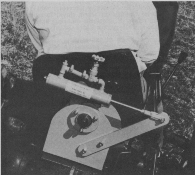
HYDRAJUST TRACTOR SEAT: Rotary Power, Inc., Centerville, Tenn.

Scatback 430 is a compact four-wheel drive front-end loader with hydraulic articulated steering and hydra-static drive. It is powered by a 30 Hp engine, either gas or diesel. Infinitely variable speeds, both forward and backward gives the operator much latitude in operation. Instant forward/reverse is controlled by a single pivot dual foot pedal. Loader is self-leveling and has a 30 degree bucket rollback at ground level to handle heaped loads. Dump clearance is 109 inches at the hinge point. For added safety, operator sits aft of the lifting arms. For more details, circle (710) on the reply card.