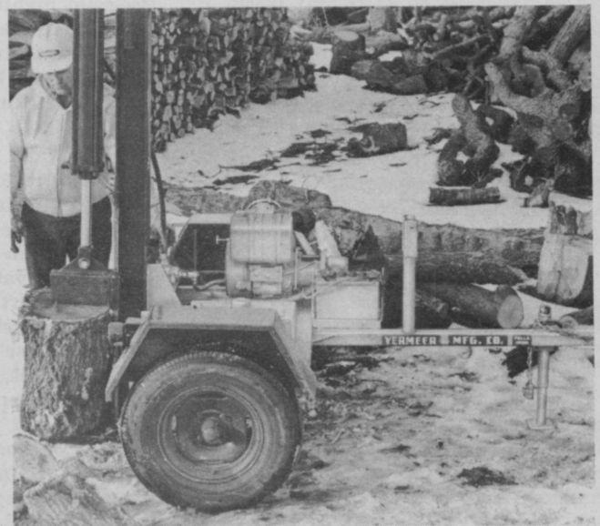
Log Splitter: Vermeer Manufacturing Co., Pella, Ia.

Digging is easy with this 12 volt digger that features a powerful two horsepower motor. It operates on any 12 volt system. Simply connect to battery on your car, truck or tractor. Digs holes two inches to seven inches in diameter. With chuck attachment, the unit will drill holes in steel, concrete and other materials. Machine comes with 20 feet of cables and battery clamps. For more details, circle (707) on the reply card.