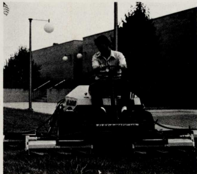
FLEX-A-MATIC 140: Hahn, Inc., Evansville, Ind.

Water and oil spills on streets, driveways and work area floors can be lifted quickly with this new product. It's available in powder form. Tests have shown the powder to be more effective than commercial floor sweep due to its higher absorptive capacity and dryness of oil and powder mixture, according to the manufacturer. To remove oil spill, pour produce over spot and then sweep away powder and oil mixture. Oil is absorbed by powder and effectively removed from surface. For more details, circle (703) on the reply card.