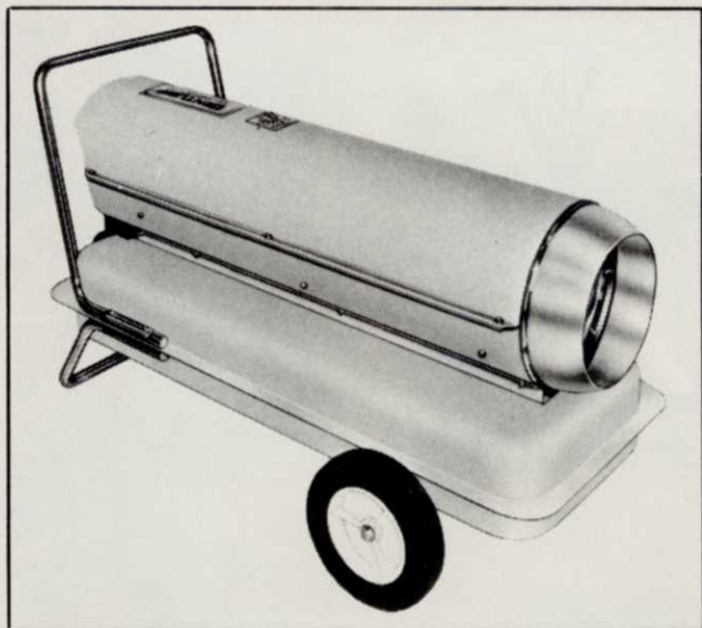
HIGH-PRESSURE HEATER: Century Engineering Corp., Farm Equip. Div., Cedar Rapids, Ia.

Here's a 155,000 BTU oil-fired, high-pressure portable heater that can take the chill off an area in a hurry. It has a 12 gallon fuel capacity that provides 12 hours of continuous heating. All you do is plug the heater in and set the thermostat. A high-pressure pump moves fuel from the tank to a valve which controls flow to the combustion chamber. A fan puts out 325 cubic feet of heated air per minute. For more details, circle (701) on the reply card.