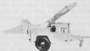
HEAVY DUTY WOOD/CHUCK