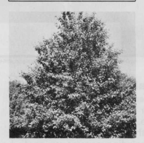
This is Midwest, a new variety of crabapple just released by the USDA Soil Conservation Service Plant Materials Center, Mismarck, N. D. It is disease resistant, winter hardy — even in Nodak country — propagates well from seed, grows fairly rapidly and makes good growth shape. It bears small apples, about ½ inch in diameter. The fruit remains on the tree and forms "raisins" that stay on until spring or until harvested by wildlife.