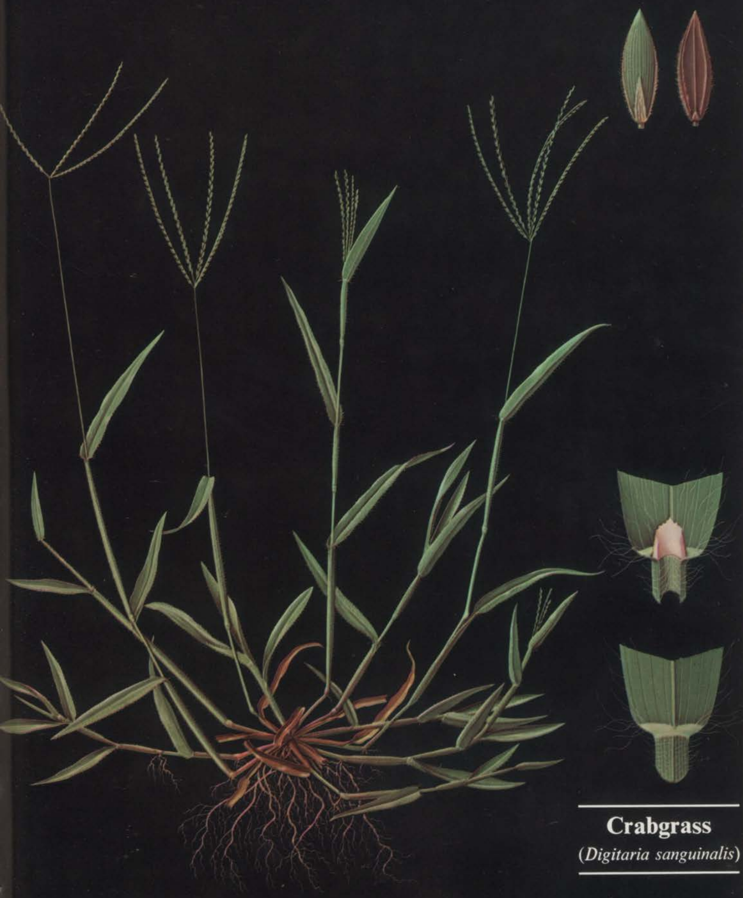
Crabgrass ( Digitaria sanguinalis )