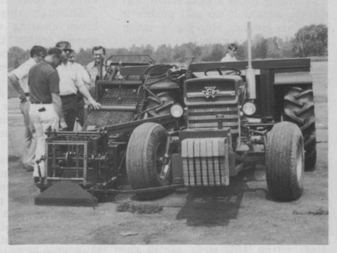
Brouwer Sod Harvester demonstration unit.