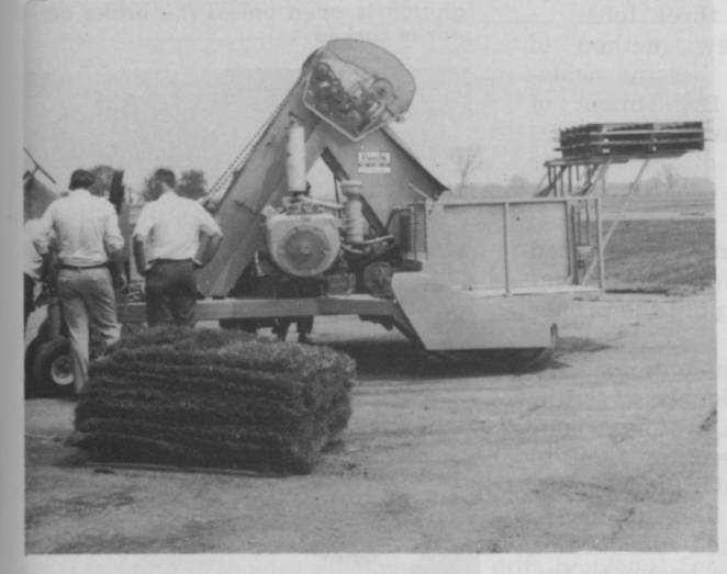
New model of Princeton Sod Harvester.