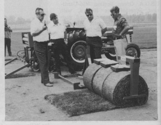
Growers discuss Beck's Big Roll System which combines harvesting and installation.