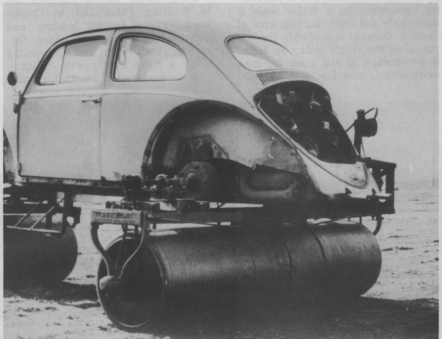
BEEBLE ROLLER — a stripped down Volkswagen does yeoman work as a turf roller for Willow Grass Farms, Fort Wayne, Ind. A 3-in. sprocket on rear axles and an 8-in. sprocket on the rear rollers gear the useful rig down to a practical speed. Steering is eased by a power steering pump driven off the fan belt.

The move was part of a major internal reorganization of LTV Aerospace which focused on formation of the commercial group and realignment of other operations.