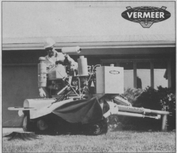
630 Stump Cutter—chews out stumps 6" below the surface, 50" wide without repositioning. Designed for hard to reach areas—backyards, cemeteries, thru gates, next to buildings. Tows behind any car, truck, tractor or jeep.

For More Details Circle (109) on Reply Card