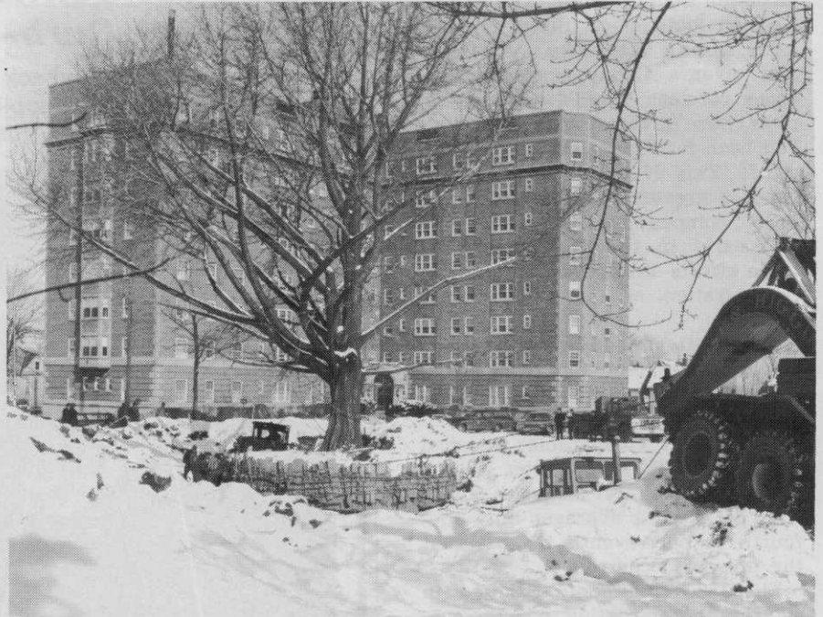
This is the 150 year old Ginkgo tree, five feet in diameter, that was transplanted by Frost and Higgins Landscaping service.