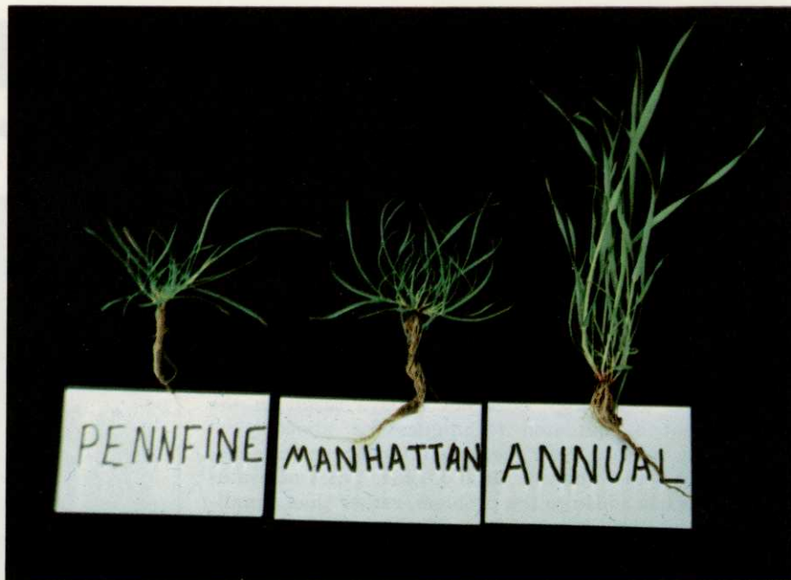
These seedlings are about six weeks old. Note the differences in color and height. The Manhattan and Pennfine varieties are fine-leaved, shorter growing and darker green.