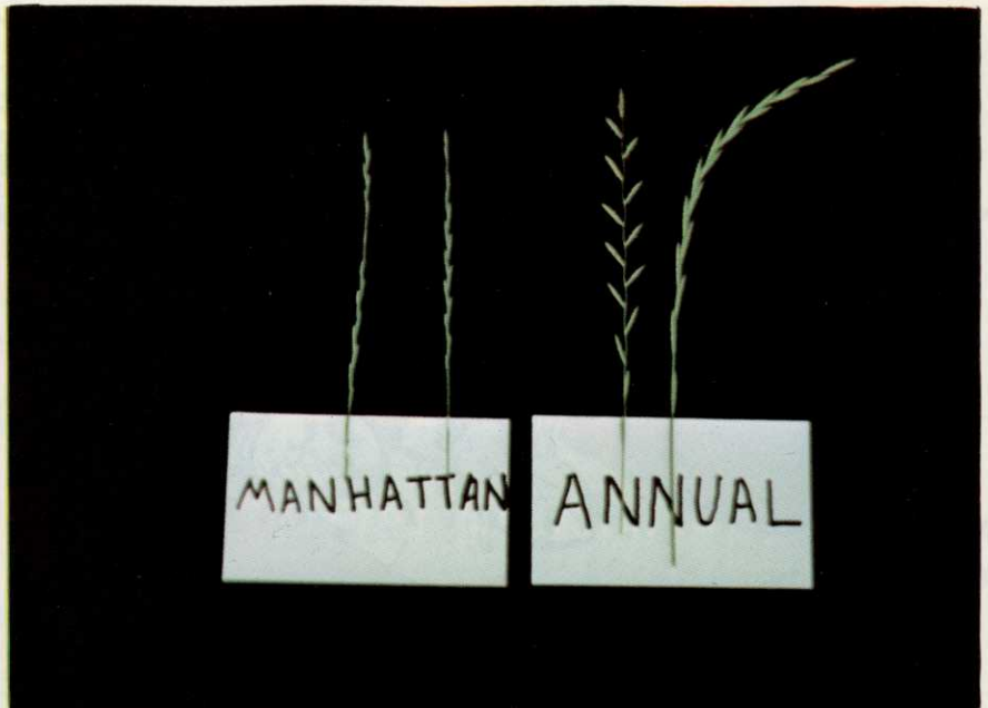
Comparison of Manhattan perennial ryegrass and annual ryegrass. Note that the Manhattan is finer-leaved and not as tall as the annual ryegrass. The annual variety is generally light green and stands more erect making excellent hay or forage.

VAUGHAN'S SEED CO. Bound Brook, N. J. 08805