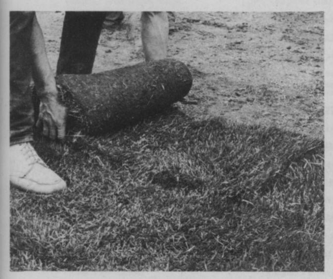
Strips of sod are rolled down end to end to create an "instant" lawn. In a few short hours a bare area can become a site of beauty.