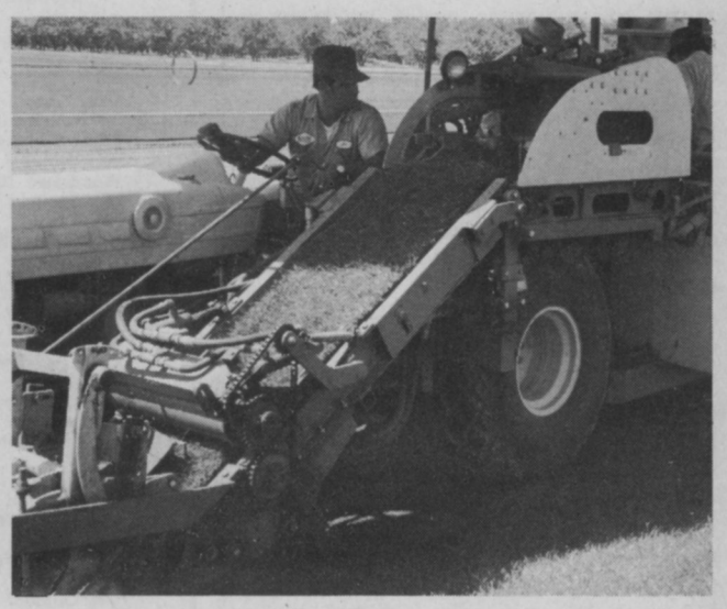
This Nunes sod harvester can cut, lift, roll or slab and palletize more than 1000 square yards of sod per hour.