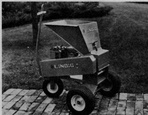
LINDIG KAJON CHOPPER

Now there is a 4 and 7 hp chopper to rapidly process branches (up to 2 1/4" dia.), yard trimmings and leaves. Kajon works just like the large chippers to turn leftover organic material into instant mulch. Bag it for convenient disposal or re-use it as natural fertilizer. Kajon replaces outdoor burning, helps keep our air a little cleaner. Gas engine or electric motor available.