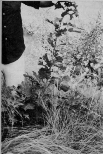
Oak seedlings were four feet high by August '70.