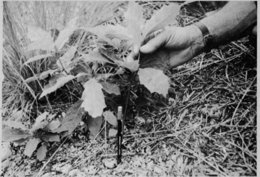
Spot planted oak seedlings on John F. Kennedy Memorial Highway emerged in the spring of 1969.

cases, produce a satisfactory stand of woody plants.